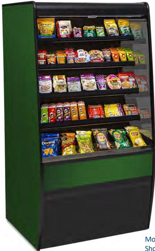
Model VNSS3678C Shown with Options

Designed with impulse sales in mind. Get maximum return from an attention-grabbing merchandiser and increase profits.