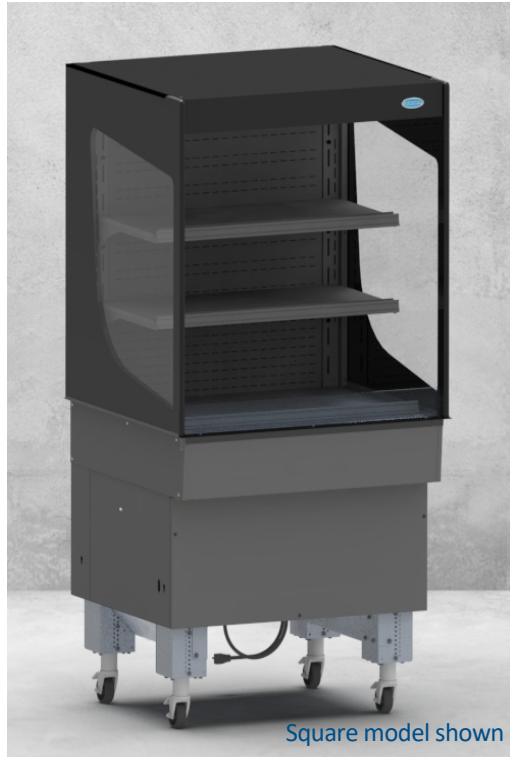
Square model shown

Designed with impulse sales in mind. Get maximum return from an attention-grabbing case and increase profits.