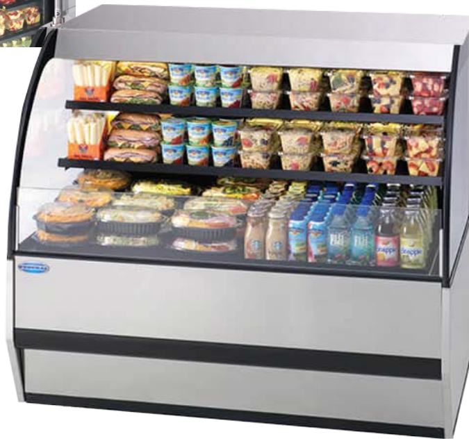
Model SSRVS5942 Shown