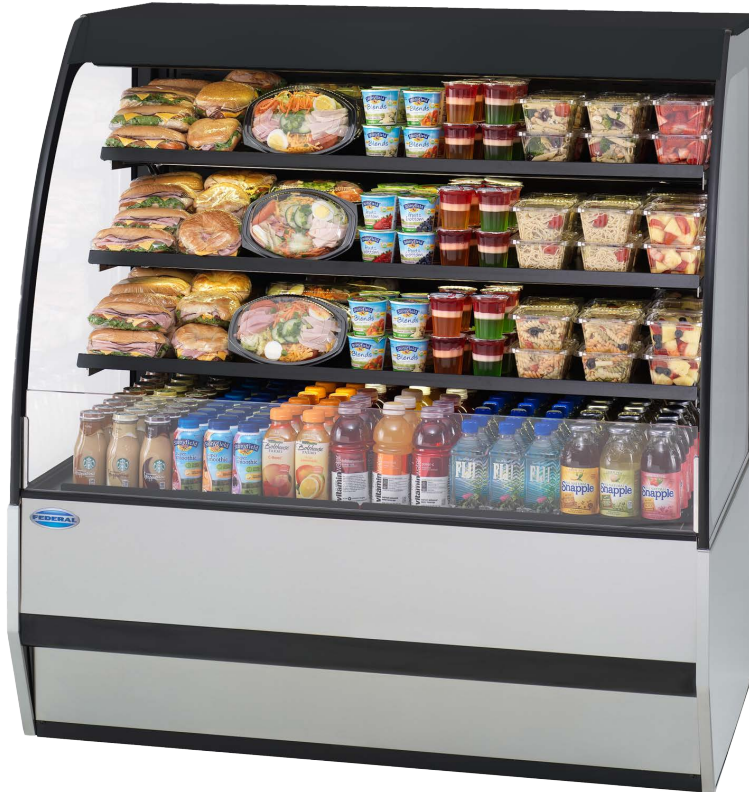
Model SSRPF5952 Shown

Designed for those customers looking for up-market styling for maximum visual appeal that will drive product sales.