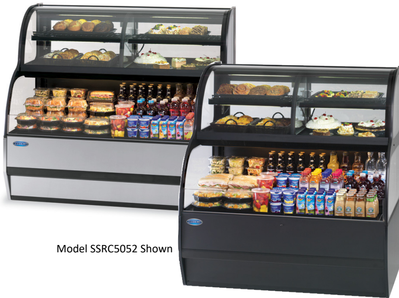
Model SSRC5052 Shown

Display a variety of products and serve more customers with pre-presentation and value in mind.