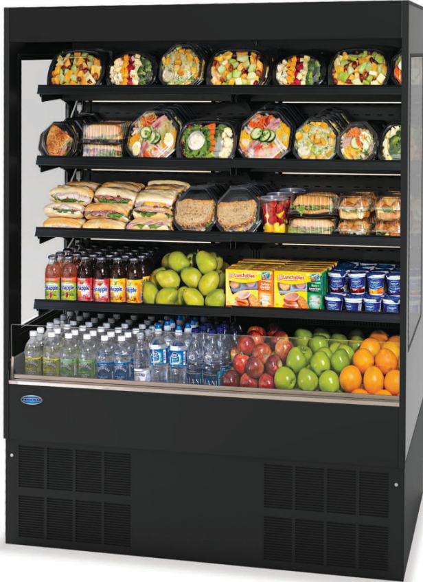
Model RSSL478SC Shown

Designed with impulse sales in mind. Get maximum return from an attention-grabbing merchandiser and increase profits.