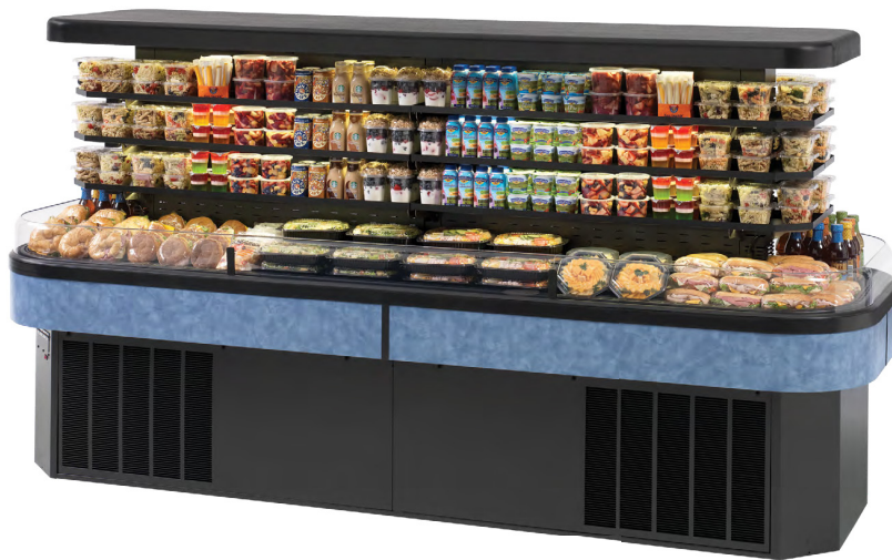
Model IMSS120SC-3 Shown