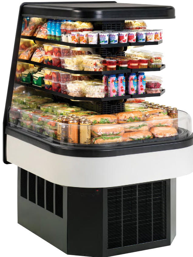
Model ECSS40SC Shown

Designed with impulse sales in mind. Get maximum return and increased profits by putting the food where the people are.