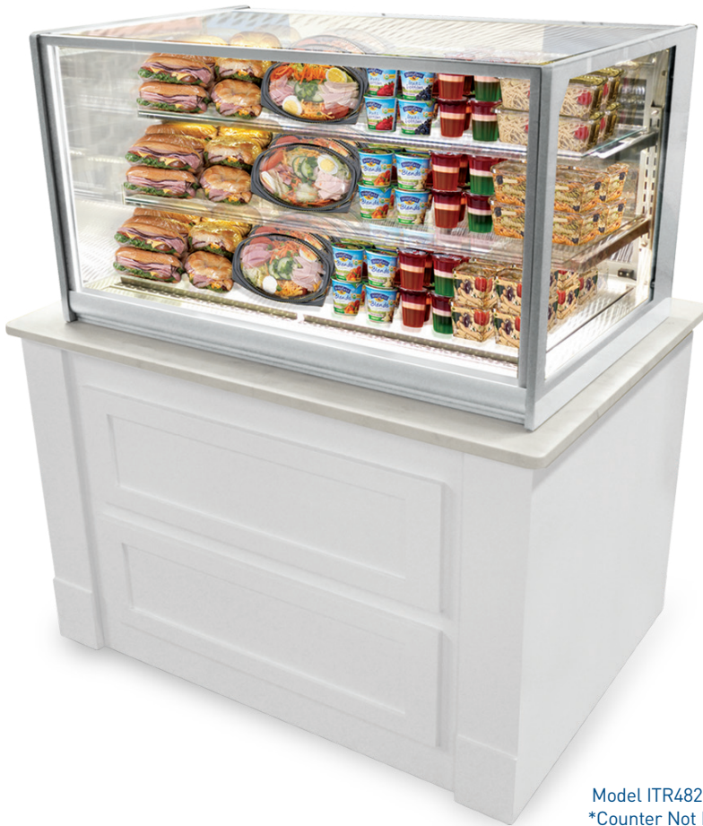
Model ITR4826 Shown *Counter Not Provided

Designed for customers looking for rich, up-scale Italian styling for maximum visual appeal that will drive product sales.