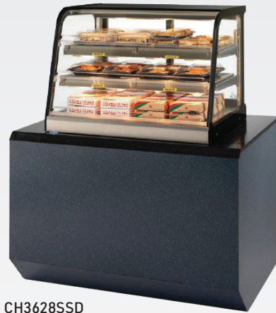
CH3628SSD (Cabinet not included)

Place countertop and undercounter cases near the register to conserve floor space, encourage last-minute extras or provide added security for items that need monitoring