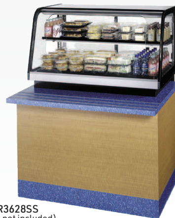
CRR3628SS (Cabinet not included)