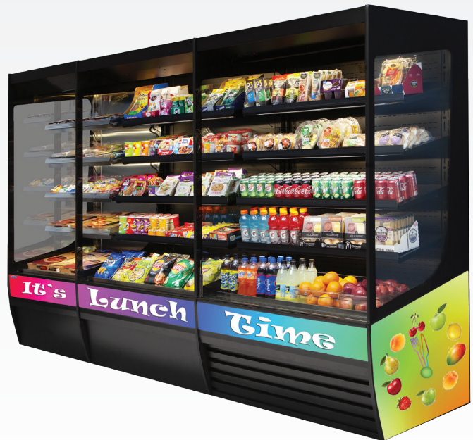
Vision Series Line-Up VHSS3678S, VNSS4878S, VRSS4878S