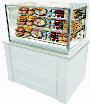
ITR4834 (Cabinet not included)

Place countertop and undercounter cases near the register to conserve floor space, encourage last-minute extras or provide added security for items that need monitoring