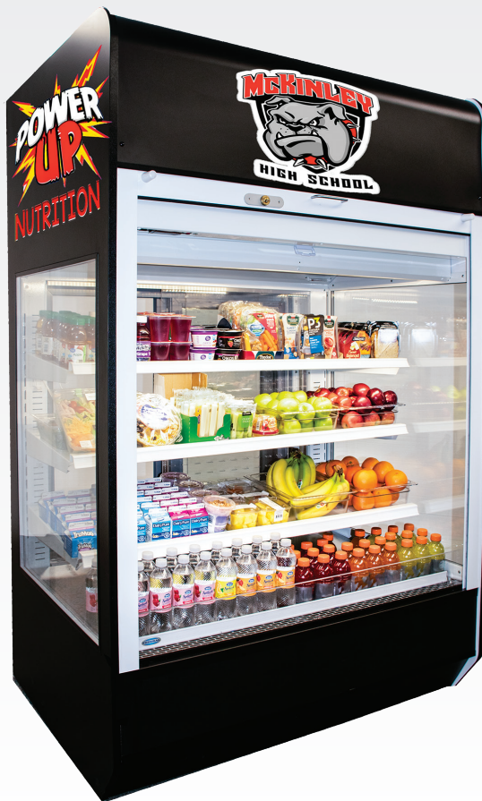
LMDM4878SC SHOWN WITH ADDITIONAL LIGHTED LED SHELVES